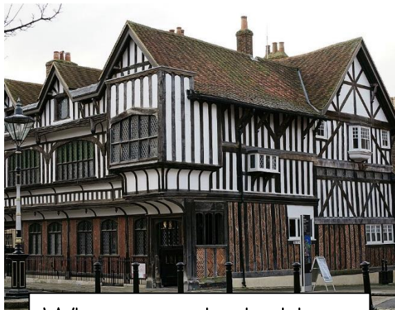
What were the buildings like in Tudor times?

Buckets were filled from the river to try to put out the fire.